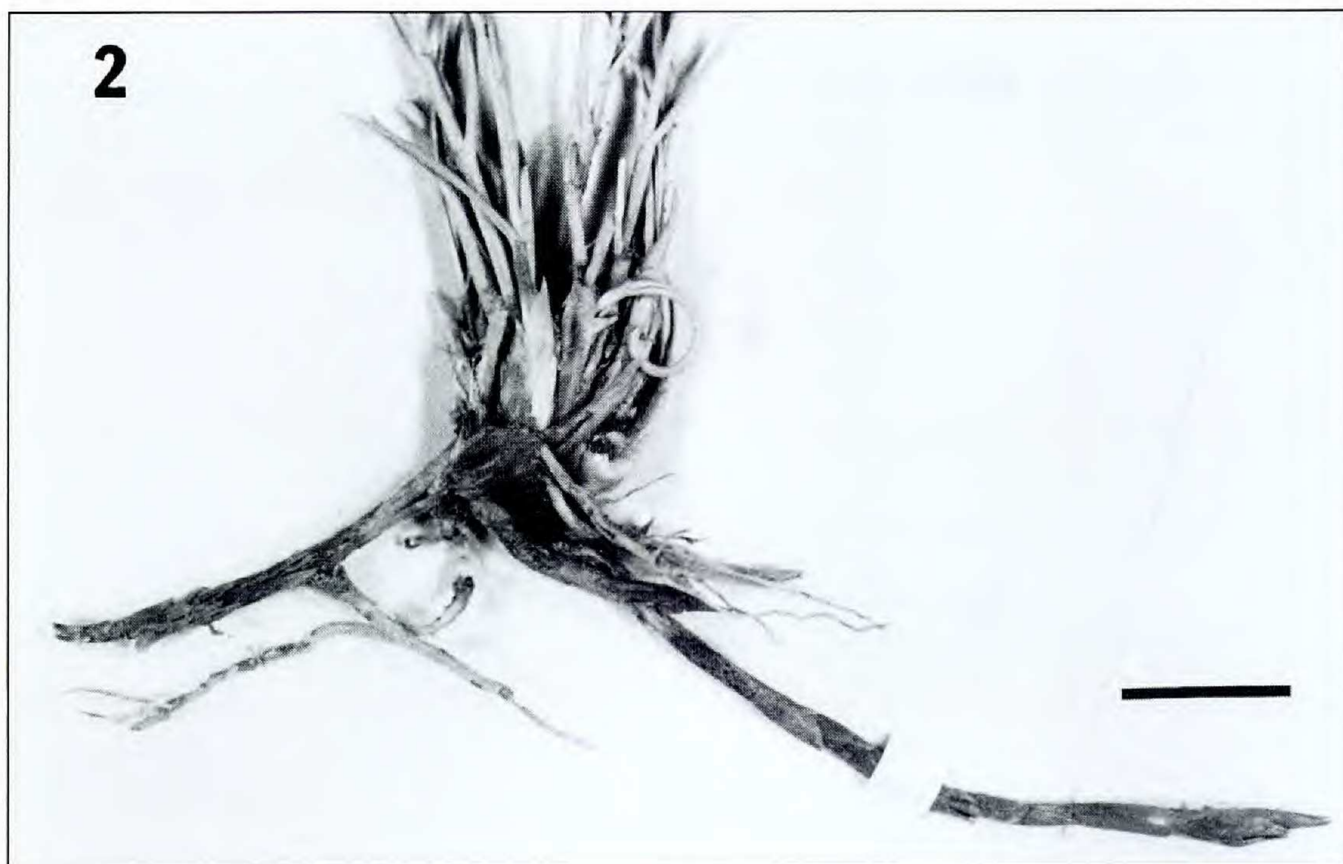
FIG. 2. Photograph of the rhizomes of Sporobolus potosiensis [Bravo 14 (MEXU)]. Bar = 1 cm.

veinless, lanceolate; second glumes 1.3–2.1 mm long; conspicuously 1-veined, vein green; lanceolate with white-hyaline margins in the distal half, slightly shorter than lemma; lemmas 1.5–2.3 mm long; conspicuously 1-veined, vein green, ovate-lanceolate, mottled purplish with white-hyaline margins in distal half; paleas 1.6–2.2 mm long, 2-veined, grooved or furrowed between veins, similar to lemma texture and color; anthers 3, 1.2–1.4 mm long, yellowish. Caryopses 0.9–1.0 mm long, 0.4–0.5 mm wide. Chromosome number unknown.